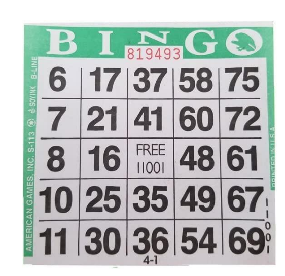
(Note: Each game half has bingo specials, which are one bingo sheets (as shown above))